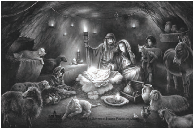
Nativity of The Lord ~ 25 December 2016

“...to you is born this day in the city of David a Saviour, who is the Christ, the Lord. This will be a sign for you: you will find a child wrapped in swaddling clothes and lying in a manger.” Luke 2:11-12